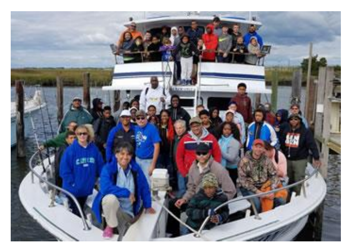
Charter fishing on the Bonanza II with NJ HOFNOD teams from Sussex, Union, Cumberland and Passaic counties.